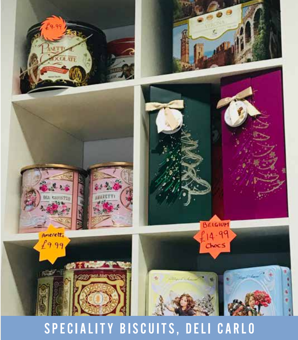
SPECIALITY BISCUITS, DELI CARLO

Plus inside the market hall you'll find everything from crumbly and creamy cheese to speciality pate and made to order hampers.