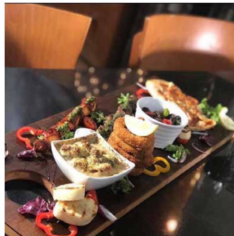
ITALIAN CHRISTMAS, AMALFI LOUNGE