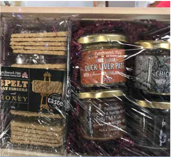
PATE & CHUTNEY SET, GILLY'S STALL