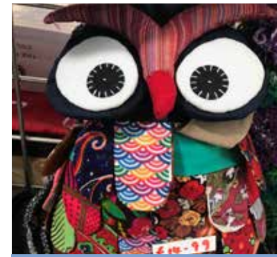
OWL BAG, PERU2U