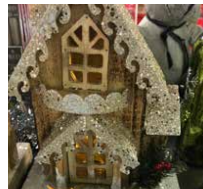
FESTIVE GIFTS, THE CHRISTMAS STALL