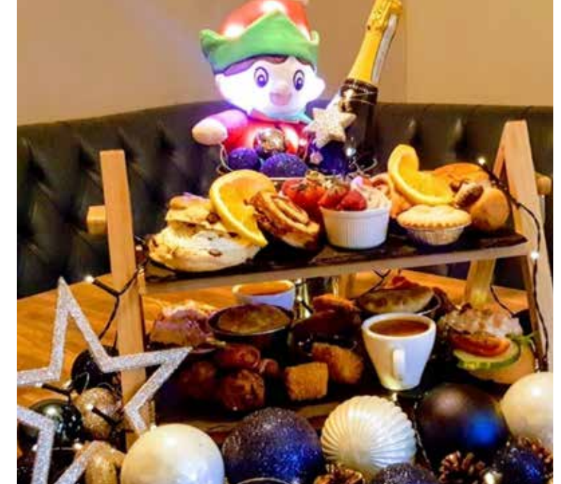
FESTIVE AFTERNOON TEA, ARTISAN