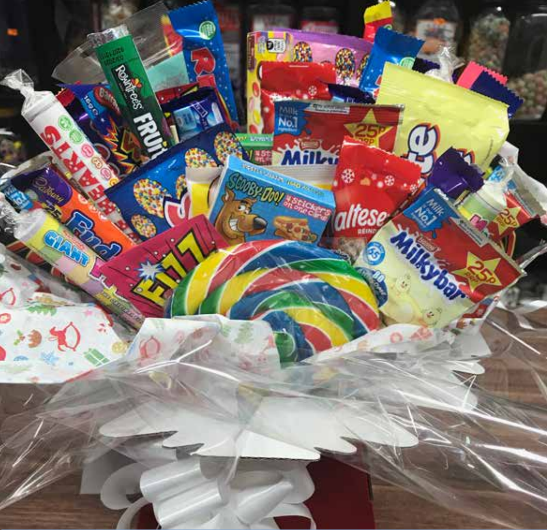
SWEET BOXES, SWEET VINTAGE