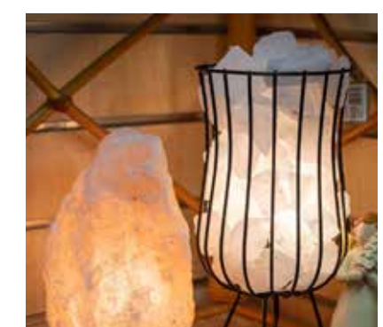
SALT LAMP, PERU2U