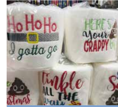
FESTIVE TOILET ROLL, MAKING MEMORIES