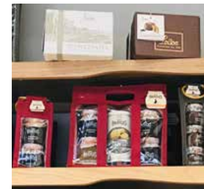
PANETTONE & SETS, DELI CARLO