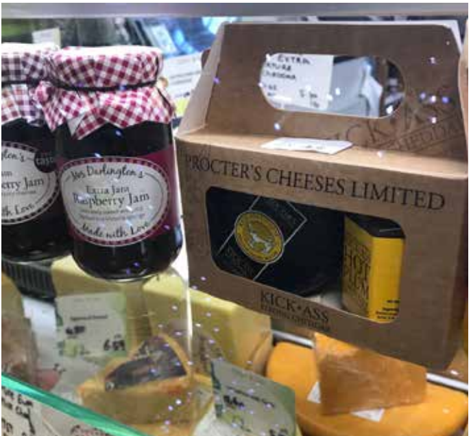
PROCTOR'S CHEESE SET, S PARR & SON