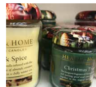
CANDLES, MOTHERGOOSE STALL