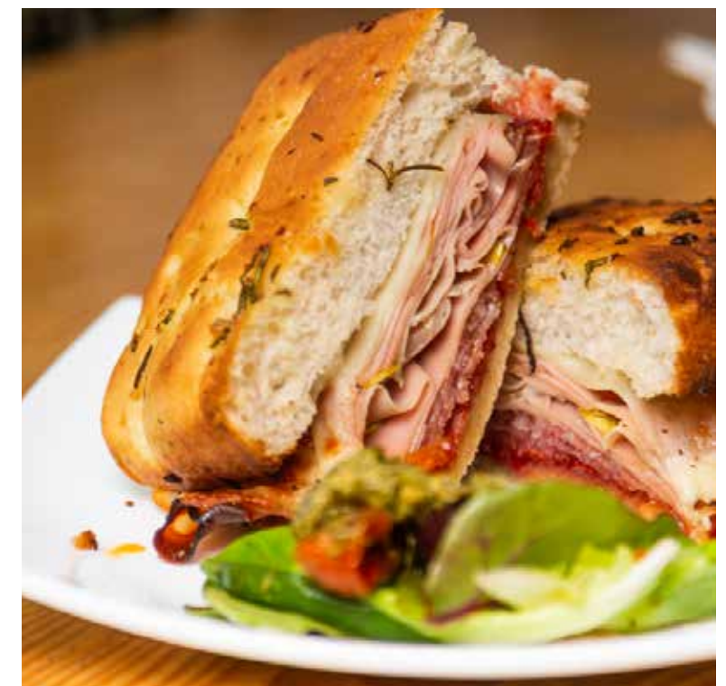
ITALIAN CLASSICS, DELI CARLO