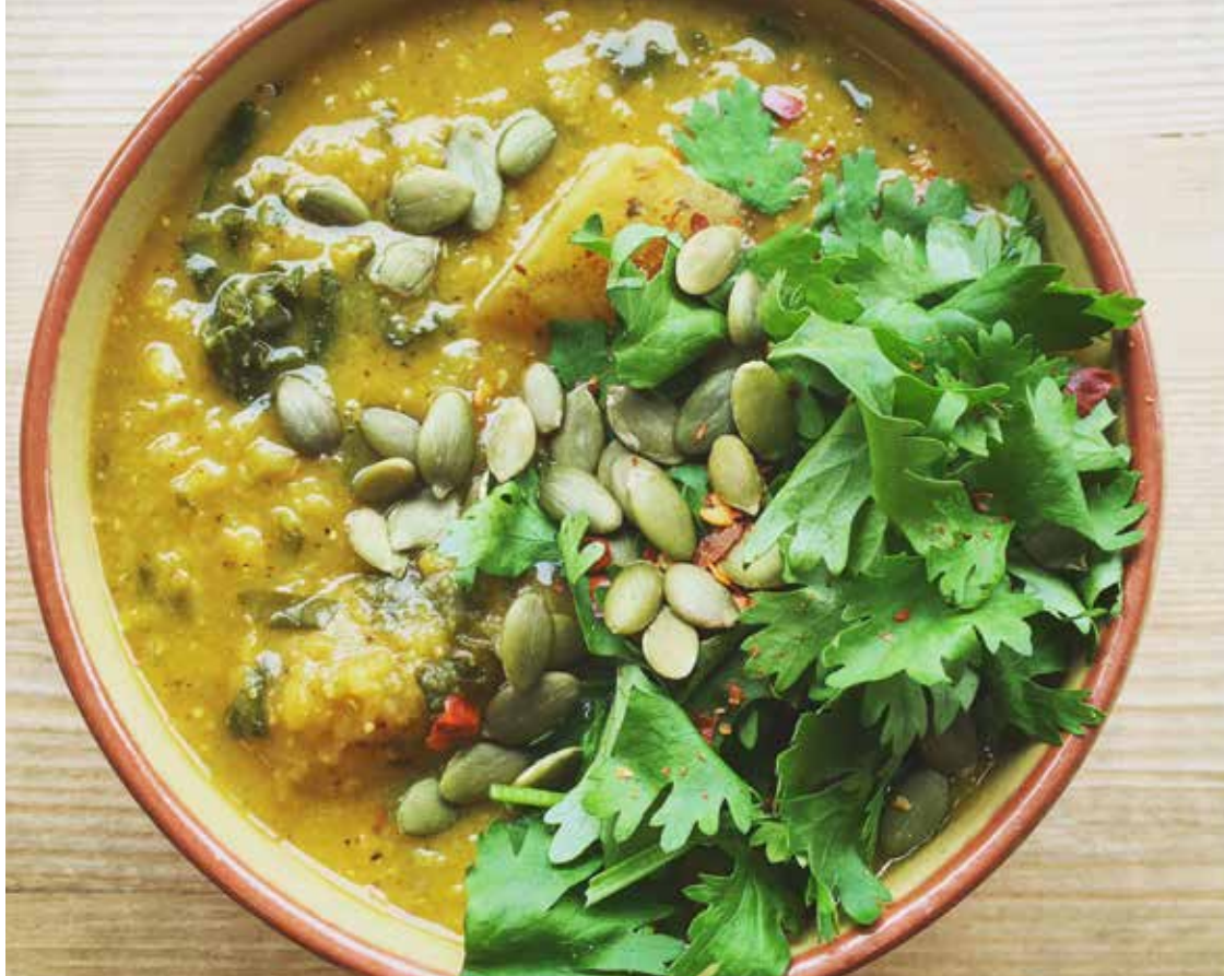
WINTER WARMERS, FREEDOM ORGANIC

D arwen has an abundance of eateries bringing people from across the county. Outside of the town centre you'll find everything from Indian to Chinese, Italian and traditional pub grub. But inside our town centre are some popular independents that really shine when it comes to cuisine and of course they all have that Darwen friendly service.