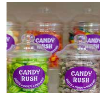
SWEET JARS, CANDY RUSH