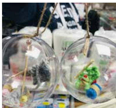
CRAFT BAUBLES, MAKING MEMORIES