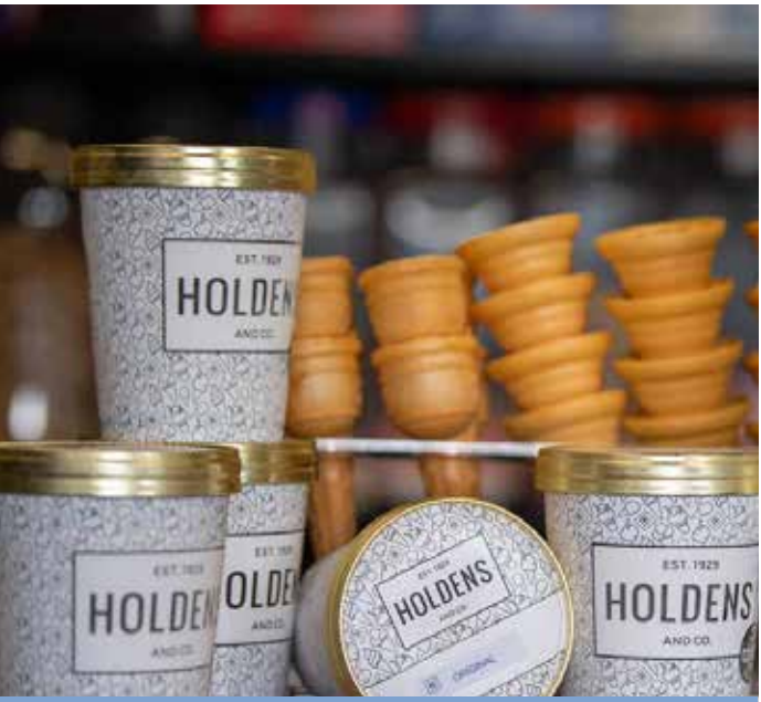
HOLDEN'S ICE CREAM, SWEET VINTAGE