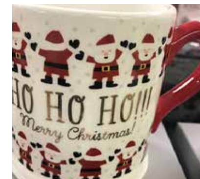
FESTIVE CUPS, MOTHERGOOSE STALL