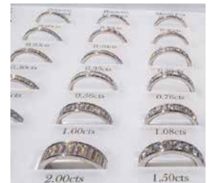
JEWELLERY, GOLD & TIMES