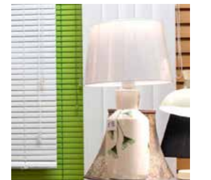
RANGE OF LAMPS, JEAN'S BLINDS