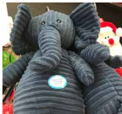
DOG TOYS, STEFF'S PETS

Of course there is also a fantastic range of affordable gifts at the market from festive homeware and novelties to sentimental gifts, sweets galore and even something for your pet.