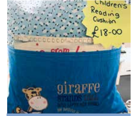
READING CUSHION, MAKING MEMORIES