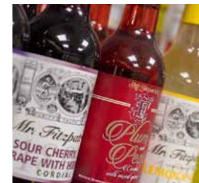
MR FITZPATRICKS, TEASE YOUR TASTEBUDS