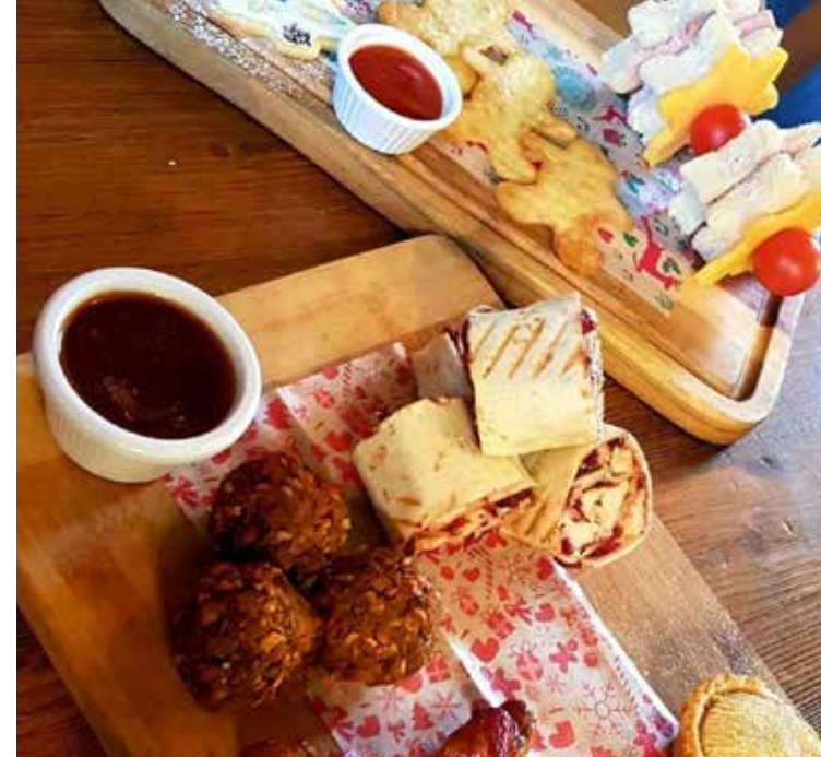
CHRISTMAS PLATTERS, TAPS BAR

Artisan cafe and wine bar you'll find on Bridge Street and Deli Carlo you'll find at Darwen Market.