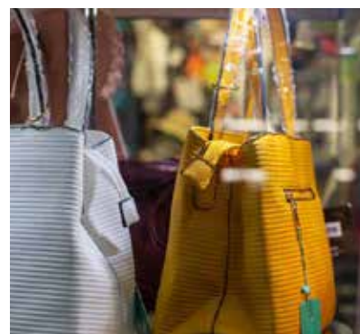
RANGE OF BAGS, BUTTERFLIES