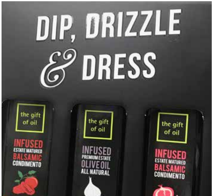
BALSAMIC SET, DELI CARLO