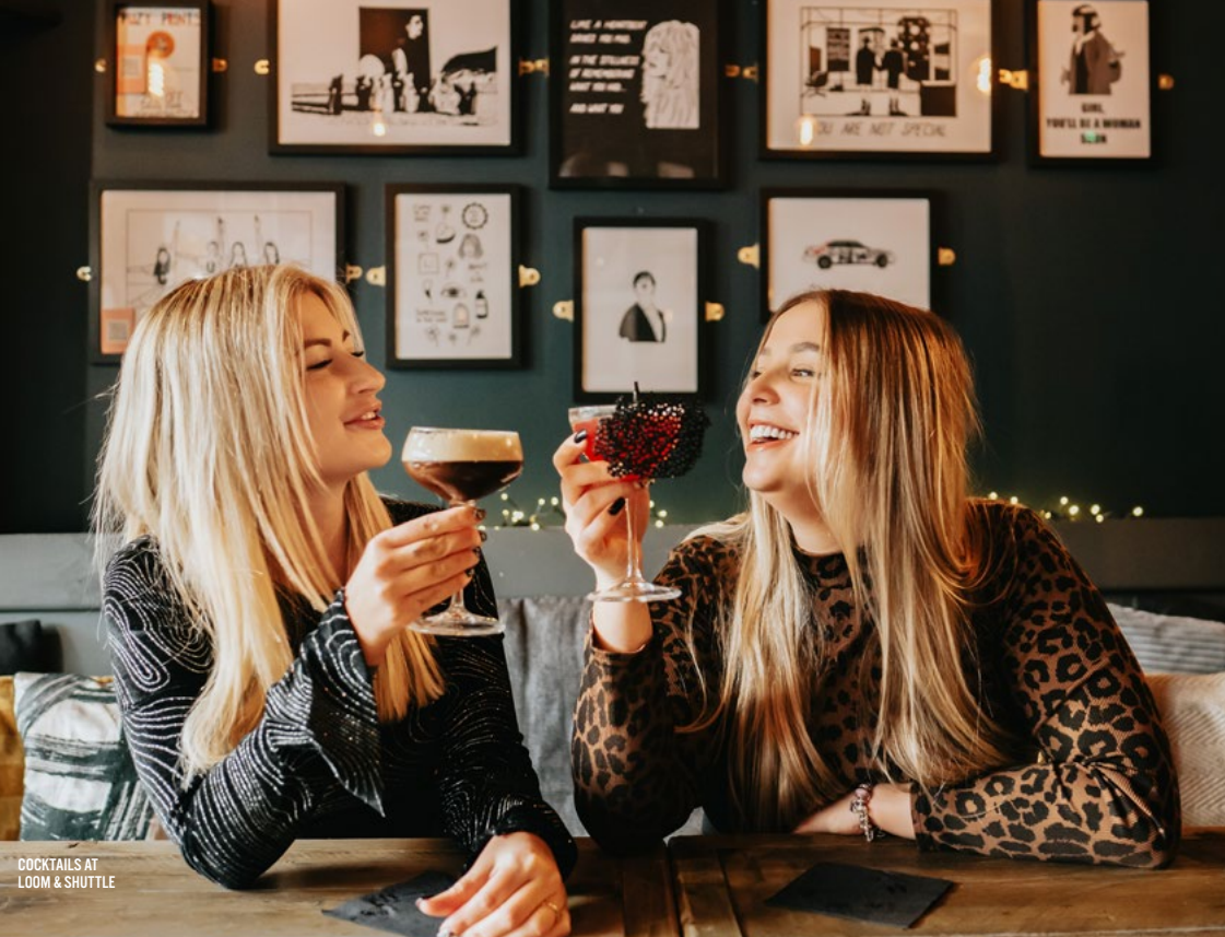
COCKTAILS AT LOOM & SHUTTLE